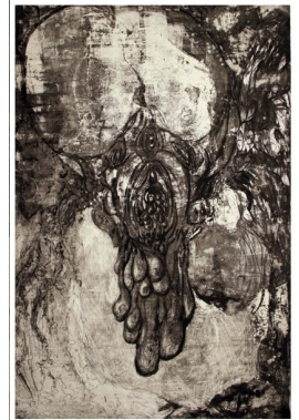
Can Play With Madneesssss 20