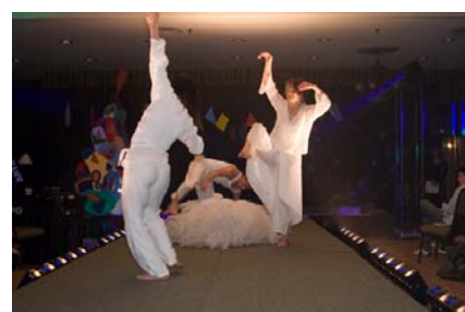
Mile Zero Dance opened the runway show