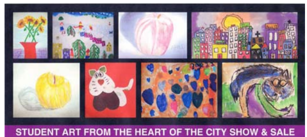
STUDENT ART FROM THE HEART OF THE CITY SHOW & SALE

This two day event is a whole lot of fun and raises money for art programs that benefit students of seven schools in the City Centre (City Centre Education Project).